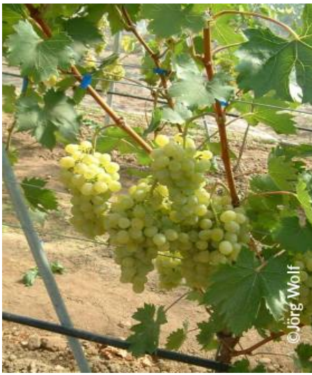
Dessert grape - small white grapes.